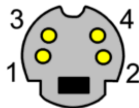
Male S-Video Plug